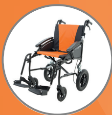
Transit version available